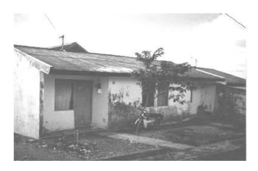
Figure 5. Type 21 - Dalung Permai – private housing projects.

developers who used the commercial bank with high interest rate and short maturity loans to finance their projects.