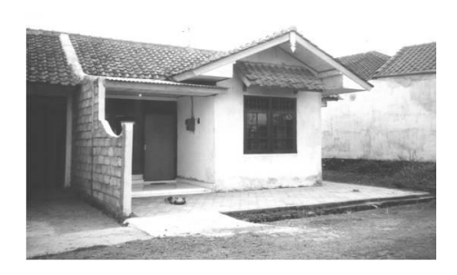
Figure 4. Type 21 - Monang Maning – public housing project.