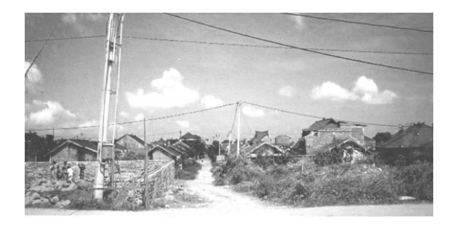
Figure 2. Road condition in Dalung Permai – private housing project.