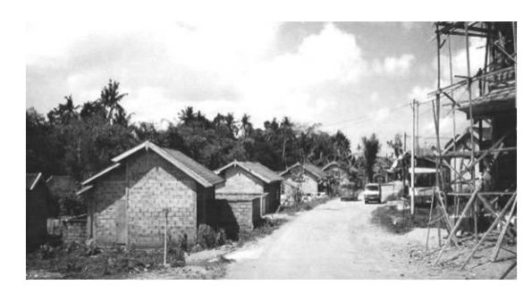
Figure 1. Dalung Permai – private housing project.