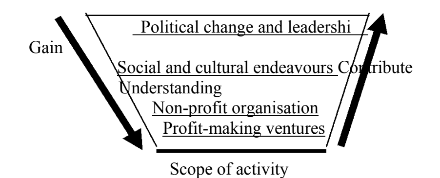
Figure 2. Entrepreneurship in its wider social context, Source: Adapted from Wickham (2001) Strategic entrepreneurship.

as they too are also involved in managing money and people. The government still needs to attract financial resources to sponsor its activities and funds needed cannot be generated using coercive approaches. People need to be motivated and this is where Maslows motivating strategy comes into play. Wickham (2001) presents the following hierarchy of entrepreneurship in its wider social context, (see Figure. 2).