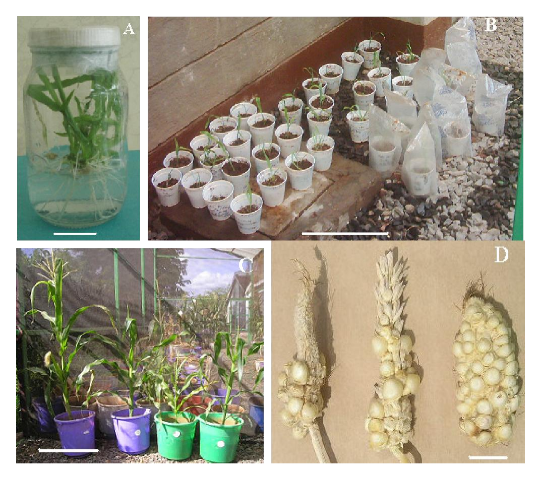
Figure 2. Regeneration of plantlets and screen house growth of Sudanese maize. (A) Plantlets Regenerating from IL3 callus cultured on regeneration II medium. Bar = 2 cm (B) Hardening of regenerated plantlets at the screen house. Bar = 25 cm. (C) Regenerated plants maturing in the Screen house. Plants growing in 20-liter pots containing loam soil. Bar = 30 cm. (D) Seeds obtained from mature regenerants. Bar = 0.5 cm.

who reported formation of compact embryogenic callus at the middle part of the scutellum and friable embryogenic callus at the basal side of the scutellum.