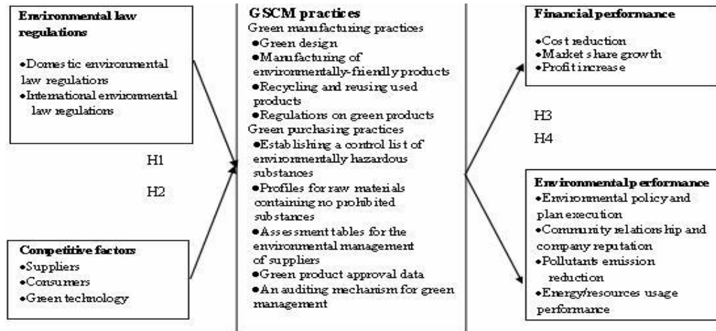
Figure 1. Research structure of adoption of green supply chain management.

Equipment Manufacturing (OEM) and Original Designing and Manufacturing (ODM). According to the International Data Corporation (IDC), ODM in Taiwan has increased significantly in the past few years. In 2004, profit increased by 38% from 2003. Flint Pulskamp, program manager of IDC's Wireless Semiconductors Research, reported that it can be seen from the profits of ODM factories, such as those producing desktops, laptops, motherboards, monitors, etc., that ODM in Taiwan plays an important role in global ODM. The top factories are almost always Taiwanese factories (IDC, 2006). Meike Escherich, principal research analyst of Gartner Research, warned that an increasing number of countries are imposing environmental regulations, and that there will be more new laws passed in the future. Therefore, more concern has to be raised related to the manufacturing of electrical and electronic products. Research is needed to enable manufacturers to ensure that their products fulfil "green" environmental regulations (Gartner, 2006).