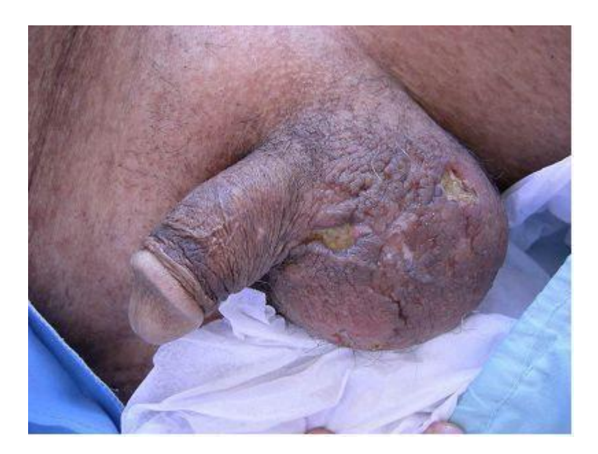
Figure 1. Multiple skin lesions on scrotum.