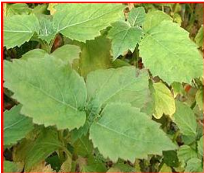
Figure 1. Pogostemon parviflorus Benth.

screening of medicinal plants for antimicrobial activities and phytochemicals is important in finding potential new compounds for therapeutic use. This paper reported the results of a survey that was done based on folk uses, by tribal people, with bioassay test for anti- Candida activity.