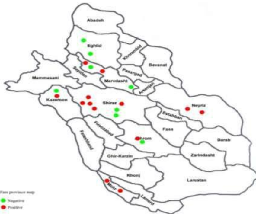
Figure 3. Map of Fars province showing the selected areas for sample collection. Dark circles show areas that the chickens had log 2 HI antibody titer \geq 4 and light circles show areas that the chickens had log 2 HI antibody titer \leq 4 .