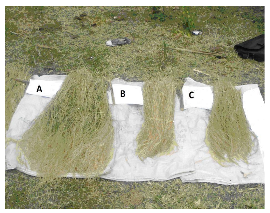
Plate 1. Teff grown around mound (A), way from mound with fertilizer (B) away from mound without fertilizer (C).

Means followed by the same letter within columns do not differ significantly by Least Significant Difference Test (LSD) at 5% of probability.