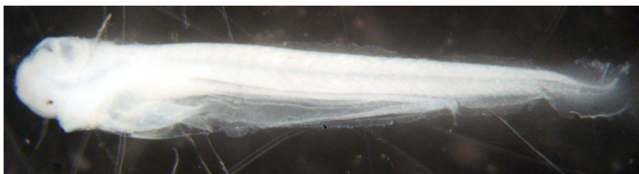
Figure 2. Newly hatched larvae of L. parvus after 20 h post-hatching.