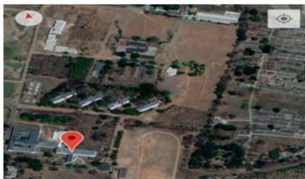
Figure 1. The study site consisting of silvopasture plots.