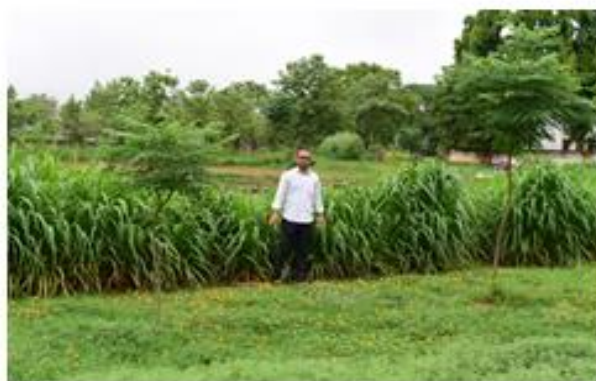
Figure 3. Research Plot.

minimum under T5 Rs.96875. Similarly, maximum net return was obtained under T4 i.e., 170925, followed by T1 Rs.153464 and minimum under T5 i.e., Rs.69550. The B:C ratio under different sole and combination of crop were found significant with its maximum value under T9 (3.66), followed by T6 (3.39), T4 (3.11) and T1 (2.95), which were at par with each other and minimum B:C ratio was obtained under T5 (2.54). This finding is supported by, who had estimated the economics of introduction of silvopasture system in the degraded land both for conservation and livelihood.