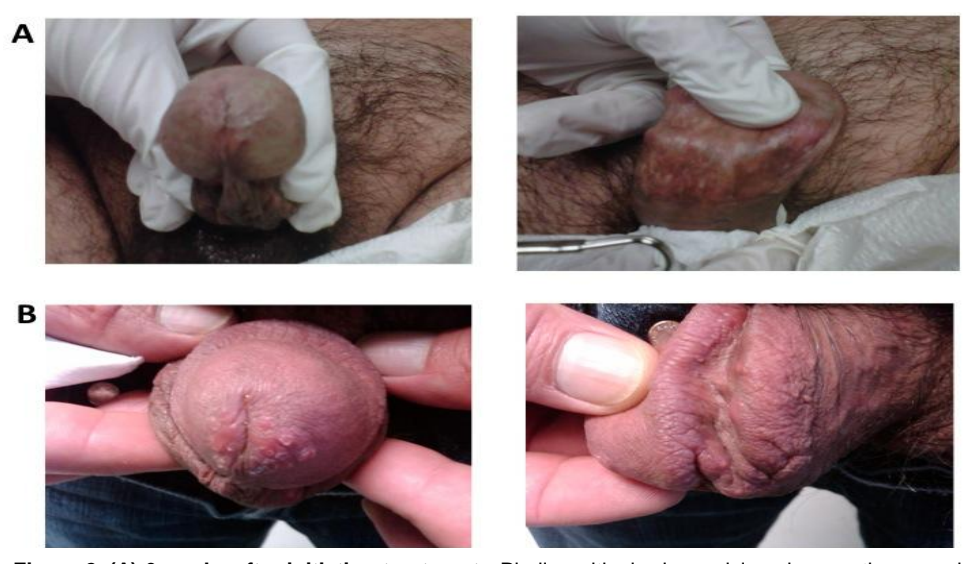
Figure 2. (A) 6 weeks after initiating treatment - Phallus with slowly resolving glans erythema and nodularity of coronal sulcus. (B) 12 weeks after initiating treatment -complete resolution of glans penis erythema with mild residual peri-meatal ulceration and small residual coronal sulcus nodules.

weeks, respectively. His initial surveillance cystoscopy and biopsy of the bladder tumor resection sites showed granulomatous inflammatory reaction with no residual tumor. The patient showed no evidence of disease after one year and he had complete resolution of his balanitis (Figure 2).