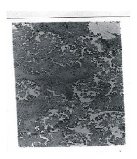
2b. LOW DOSE group (315 mg/kg) rat testis showing mild spermatogenic arrest