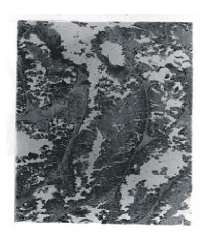
2d. HIGH DOSE (945 mg/kg) showing complete spermatocytic arrest and relatively empty lumina, Magnification x 70.