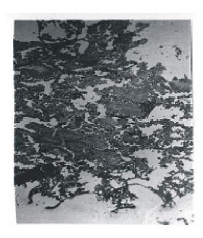
2c. MEDIUM DOSE (630 mg/kg) showing moderate spermatocytic arrest and moderate amount of germinal cells sloughing in their lumina.