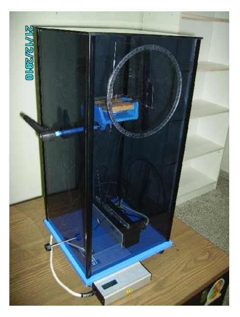
Figure 3. König pendulum hardness.