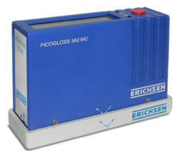
Figure 5. Glossmeter.

Table 1. Statistical data of surface hardness, scratch resistance and glossiness values.