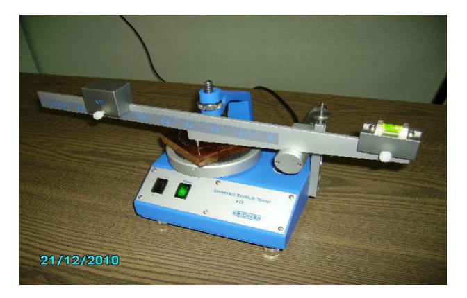
Figure 4. Scratch resistance.

cleaned by brush, considering the recommendations of the manufacturer company. Dye has been applied as 3 layers for boards coated with paper and as 5 layers for board uncoated with paper (Cakicier et al., 2010).