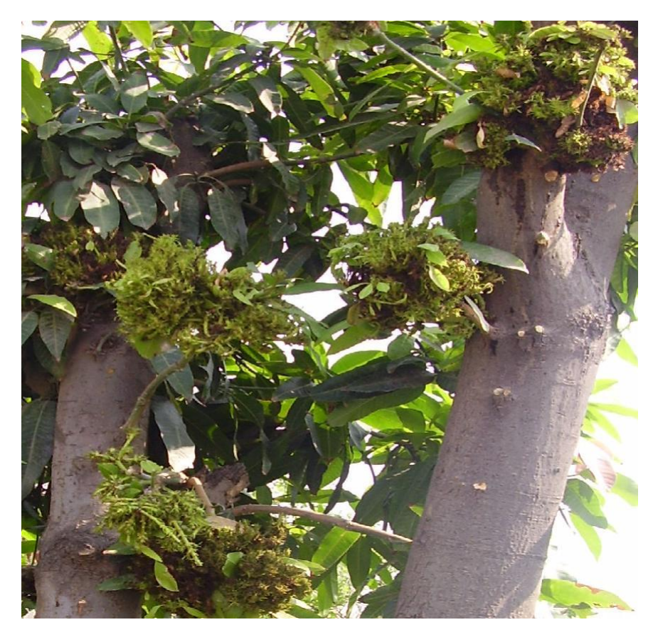
Figure 1. Malformed heads hanging on mango tree.