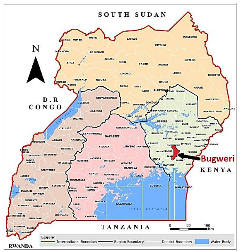
Fig. 1. Location of Bugweri district on the Ugandan Map.

The overall sample size of the study area was determined using the statistical formula by Kish and Leslie in Equation 1 (Staff et al., 2010).