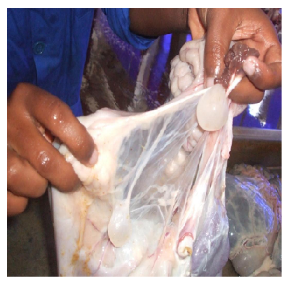
Figure 1. C. tenuicollis on the abdominal wall of carcass.

62.8% in (Omentum). These results agree with results of cystcerci in sheep (84.85%) and goats (82.14%) omentum by Radfar et al. (2005). The infestation rate of C. tenuicollis was higher in the omentum of adult goats (67.4%) than the young ones (57.9%). Therefore, regarding the infestation rate of C. tenuicollis ; there was a statistically significant difference between young and adult goats and sheep.