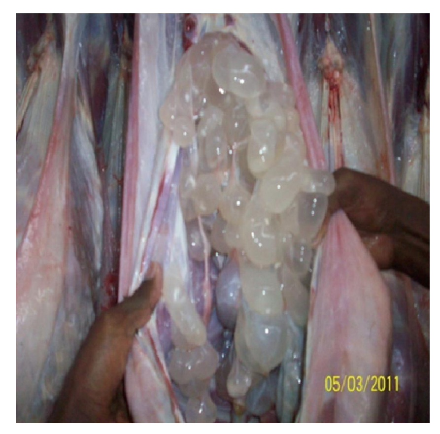
Figure 2. C.tenuicollis on the Omentum.