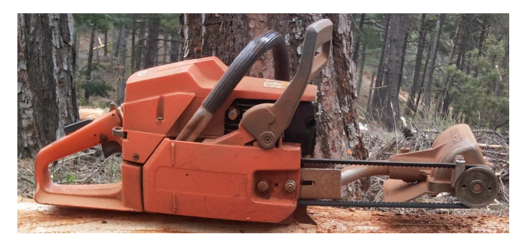
Figure 1. The general view of log debarker.

into a new tool as debarker to peel tree bark, produced by a variety of international and national firms, as well. It can be simply attached to any chainsaw and it manages into action as a log debarker. The power transmission is provided with the help of a strap (V-type) connected to the chainsaw drum gear. Made of various types of fasteners for chainsaws are mounted to the chainsaw body by removing the plate and closing the chain lubricating system (Figure 1). Assembly can be made directly to the body of chainsaw with the help of carrying handle of debarker attachment and/or to plate for low volume of chainsaw (Anonymous, 2010; BASEH, 2010; TrioAgri, 2010).