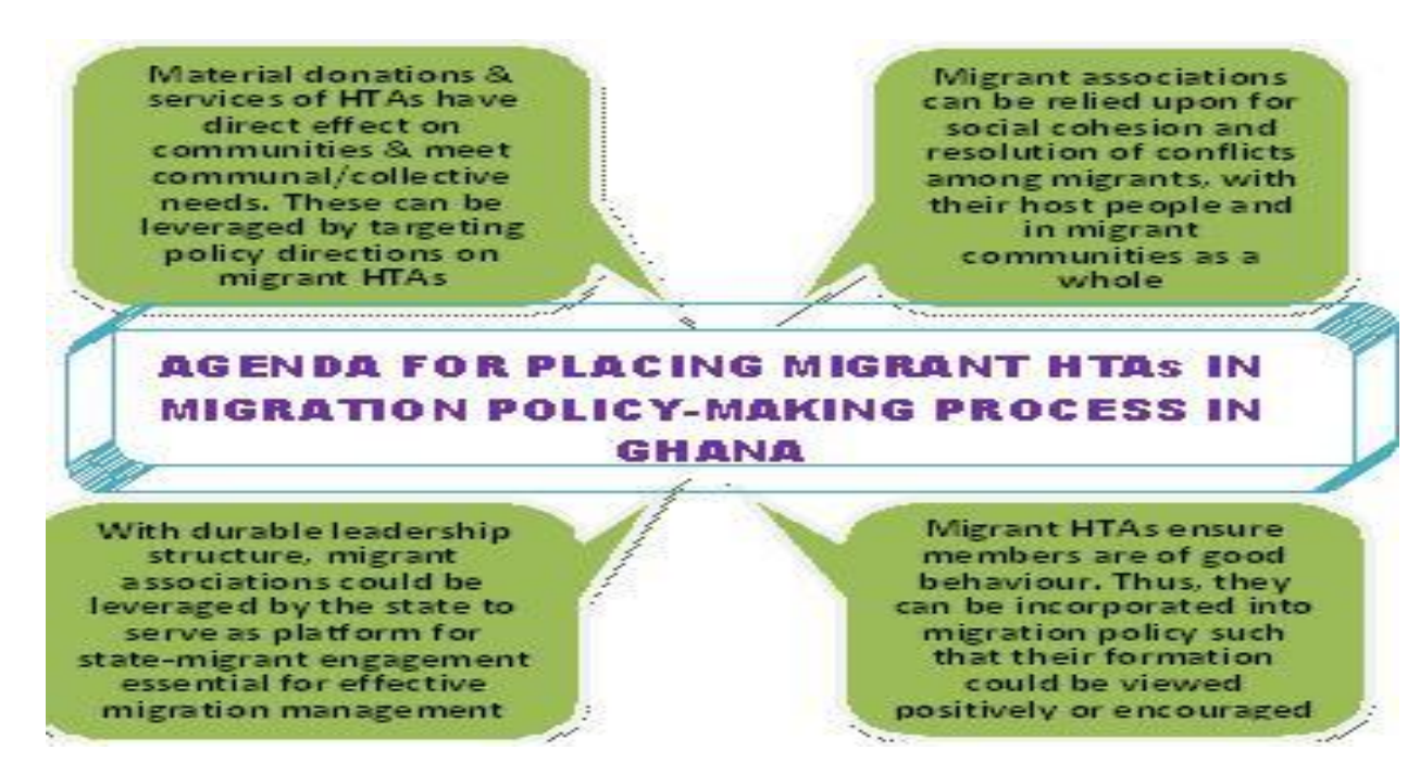
Figure 2. A summary model for placing migrant HTAs in migration policy discourse.

various institutions in Ghana (Owusu, 2000:1174) for collective effect.