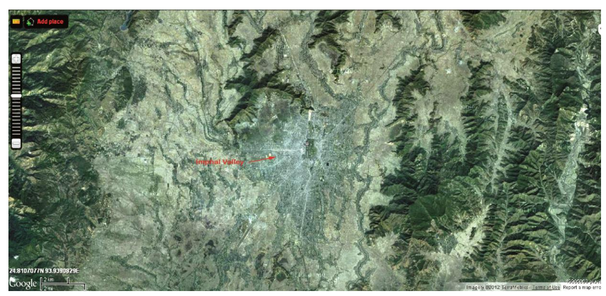
Figure 1. Imphal valley, Manipur (India), location site of the study.