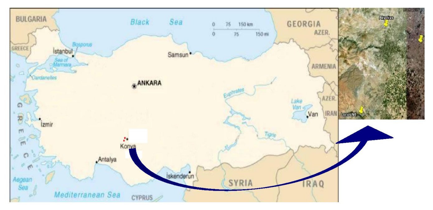
Figure 1. Location of the study areas in Turkey map and Google earth satellite image.