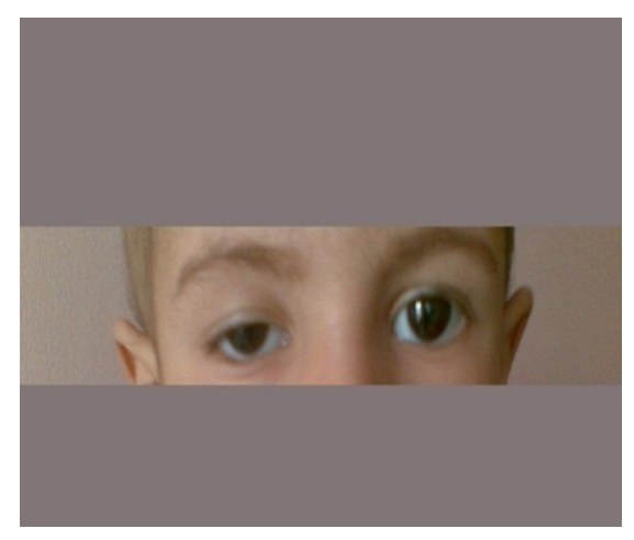
Figure 1. Unilateral ptosis developing after acumulativedose of 7.5 mg of vincristine.