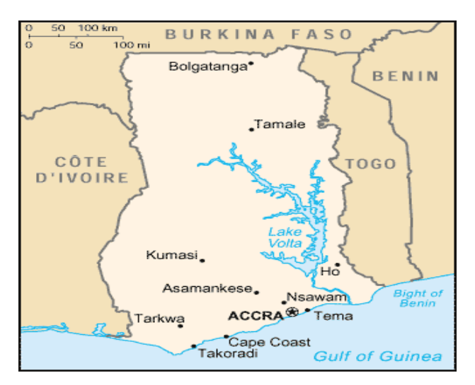
Figure 1. Map of Ghana and Greater Accra Region