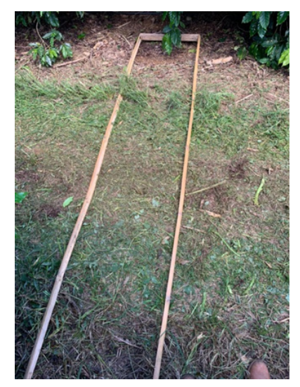
Figure 2. Area carved in treatment 2.

To survey the biomass production, quantification of carbon sequestration and nutrient flow, biomass was collected from the aerial part of the plants contained in the two treatments after using a brush set at 0.01 m above the ground. Fifteen points were collected in each field. The collection was carried out in the period of full vegetative growth, 60 days after the planting of Brachiaria and growth of spontaneous plants. After cutting with the implement, wooden screens were used to delimit the 2 m^2 area to collect the plant material from the plants (Figure 3).